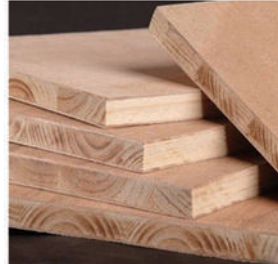
Furniture and wood