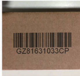
Dynamic Security barcode