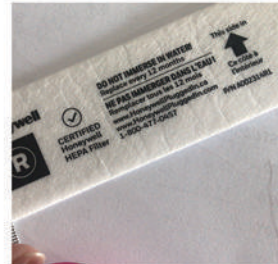
Multi group printing