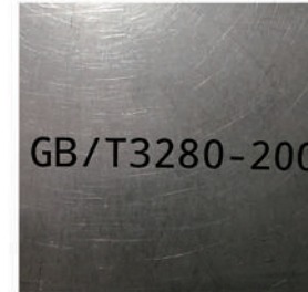
HD bold font